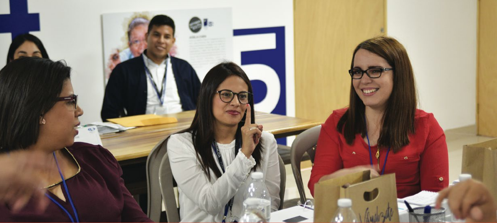
The first Eyexcel LA workshop was held Guatemala in July.