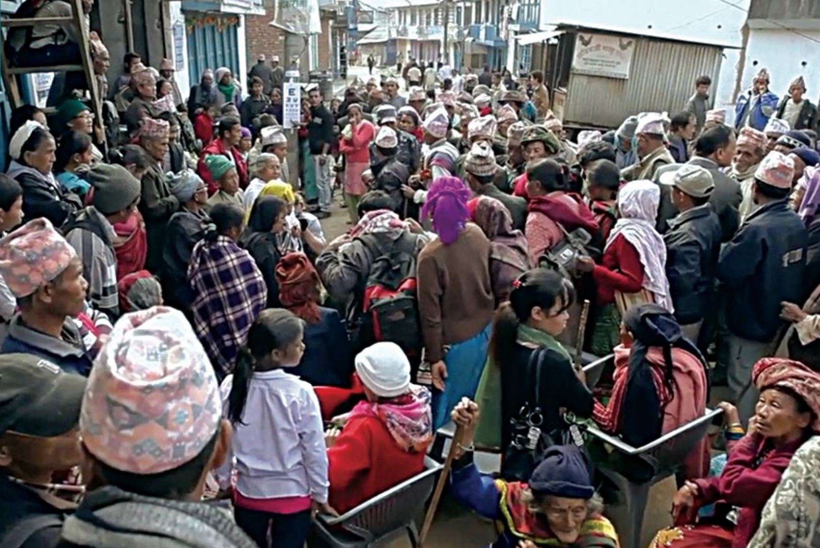
Seva supports access to eye care services in underserved communities around the world.