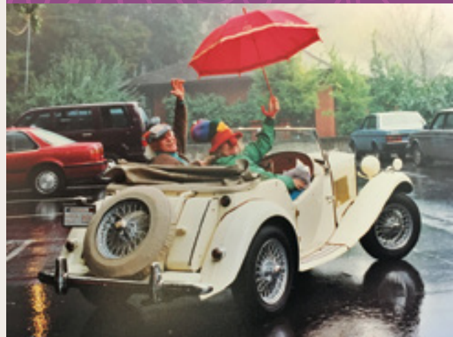
Photo: Wavy Gravy and Ram Dass in a vintage MG that was generously donated for an auction to support Seva's programs.